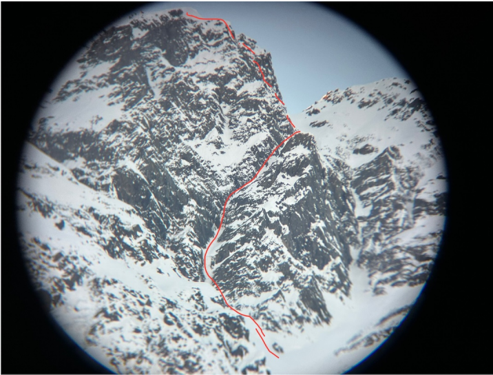
The line of Blood and Sand (1,800', AI4 M4) on the east face of South Mile High Peak.