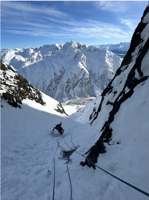
Rafael Alfaro follows a pitch on the east face of South Mile High Peak during the first ascent of Blood and Sand (1,800', AI4 M4). Alfaro and Wyatt Jobe descended the south face on splitboards.