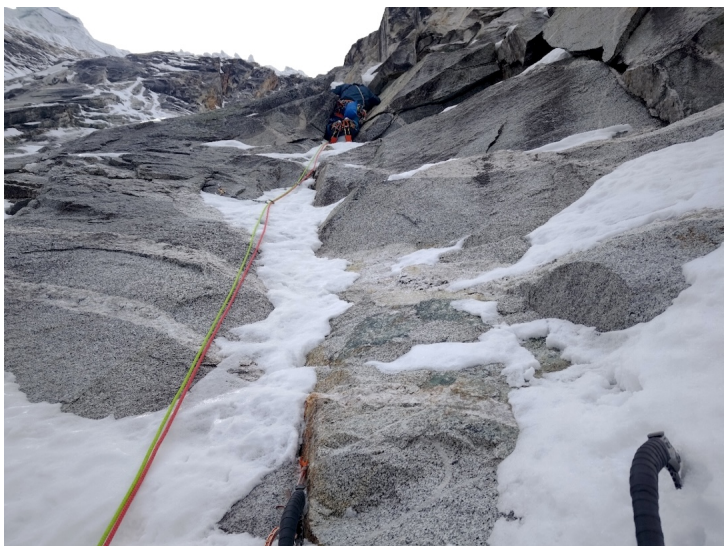
A mixed step during the ascent of Orgasmo Multiple on the south face of Ocshapalca.