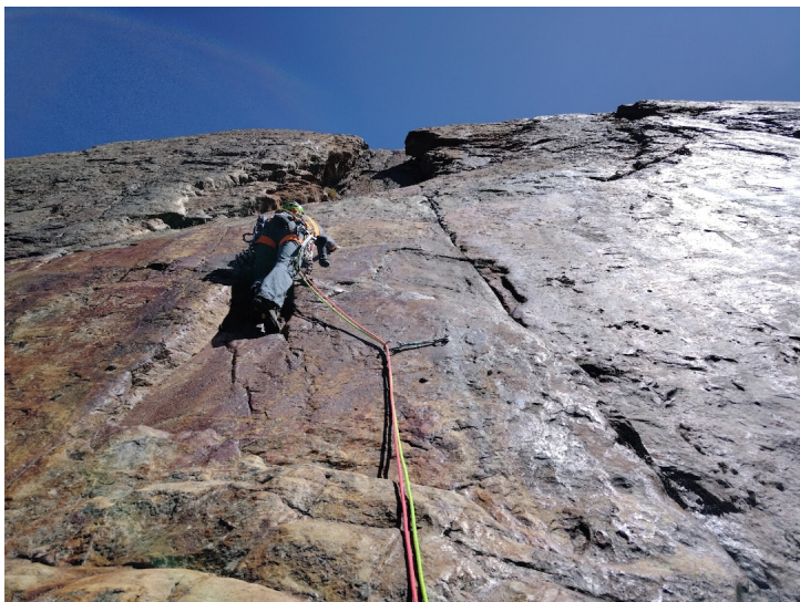
Nice rock on Torre Tauar. The climbers placed three protection bolts on the 340-meter route.