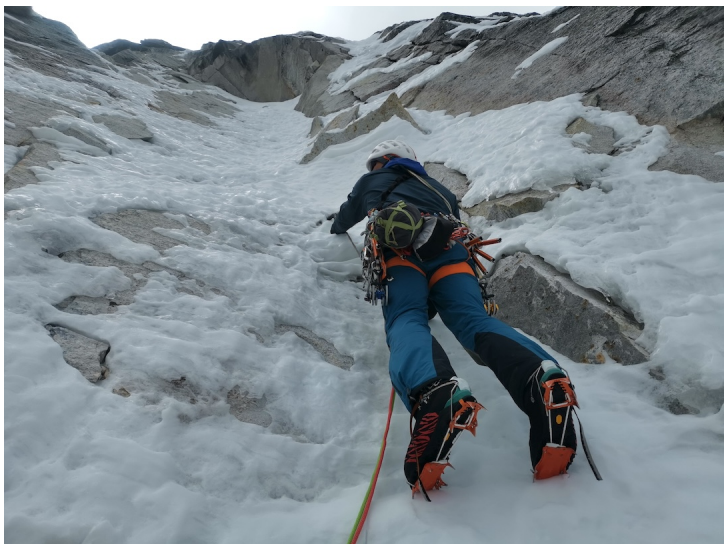
Ice climbing during the 2024 ascent of Orgasmo Multiple on the south face of Ocshapalca.