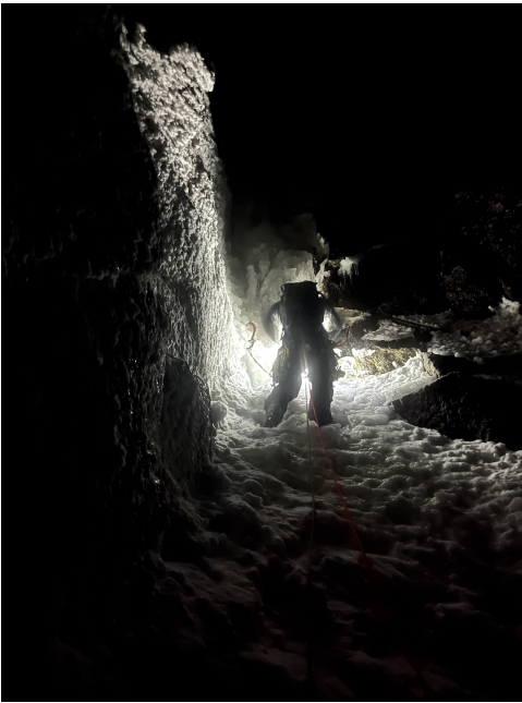
Cameron Jardell tackling the exit chimney pitch to the west ridge of Dean (5,833').