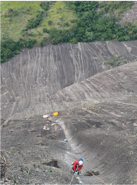
Kenza Slamti on pitch 15 (7c+) of Rabiosa (900m, 21 pitches, 8a).