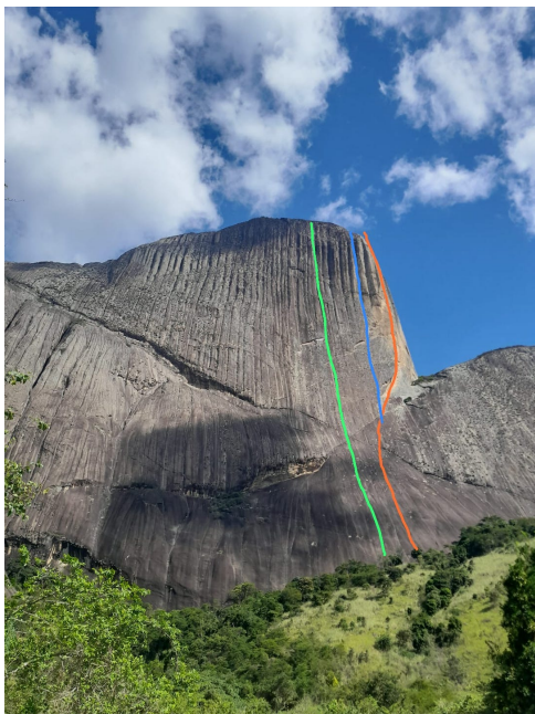
The northeast face of Piedra Riscada showing (in green) Rabiosa (900m, 21 pitches, 8a), climbed by the Roc Adventure Programme team in 2023; (in blue) Viaje de Cristal (900m, 8a, Elorza-Gratton-Moisés-Perc, 2015); and (in red) Place of Happiness (850m, 7c, Gerais-Gratton-Glowacz-Heuber-Fengler, 2009).