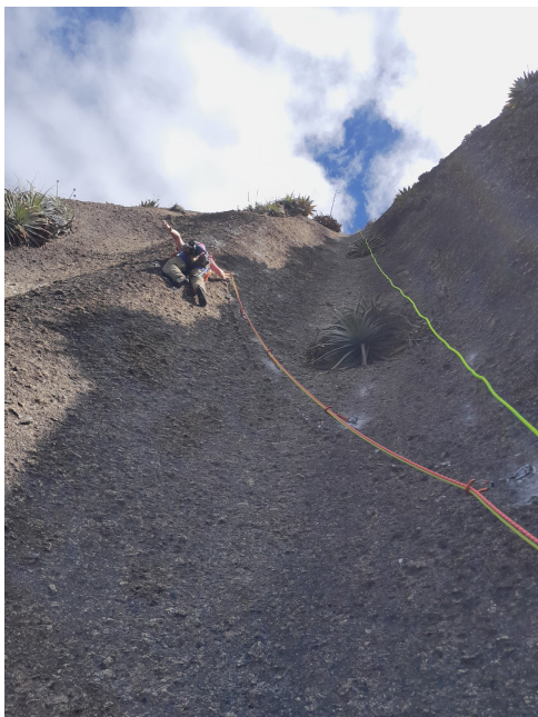
Kenza Slamti on pitch 18 (8a) of Rabiosa.