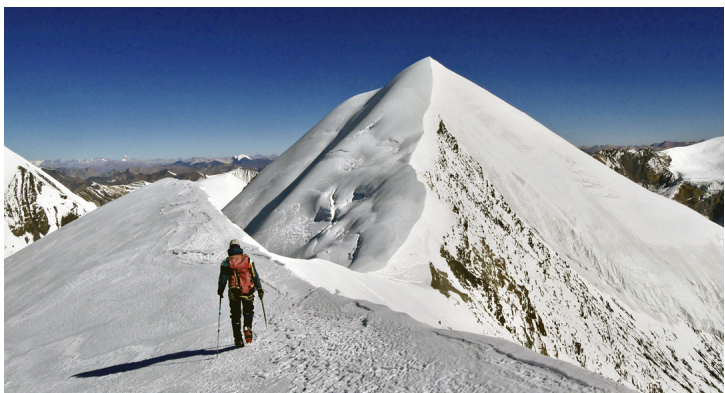
Heading north toward the summit of Phurba Kang from Sanu Phurba.