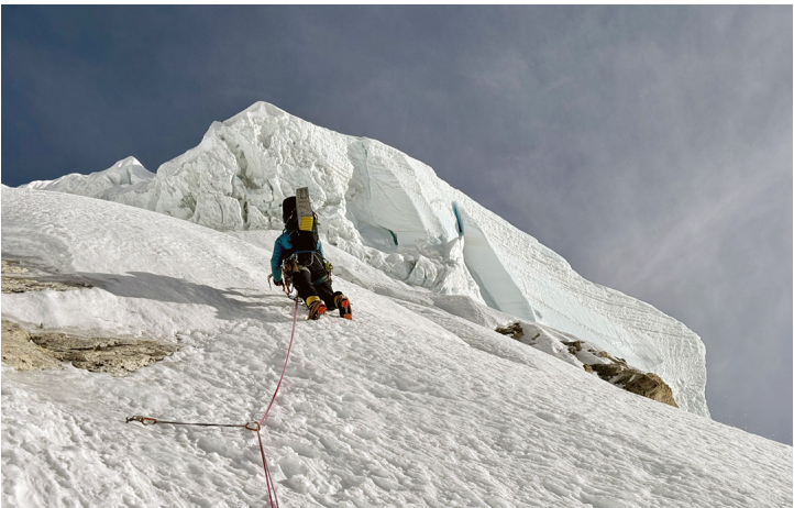
Jakub Vlček approaching the left side of the great serac on the first day of a new route on the west face of Tengi Ragi Tau.