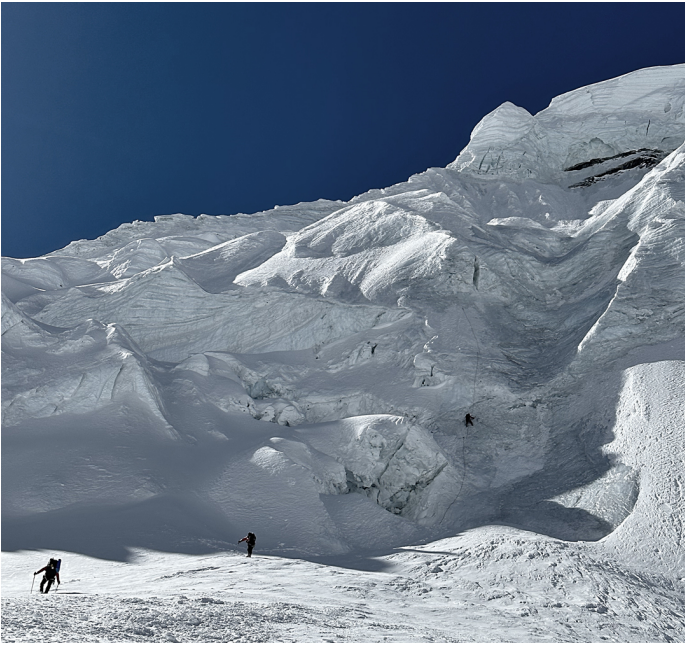
The lower section of the northwest face of Goldum, climbed by the 2023 expedition to reach the north-northeast ridge.