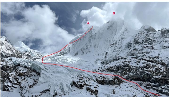
Looking east up a side glacier from the Langtang Glacier, showing the approximate approach to