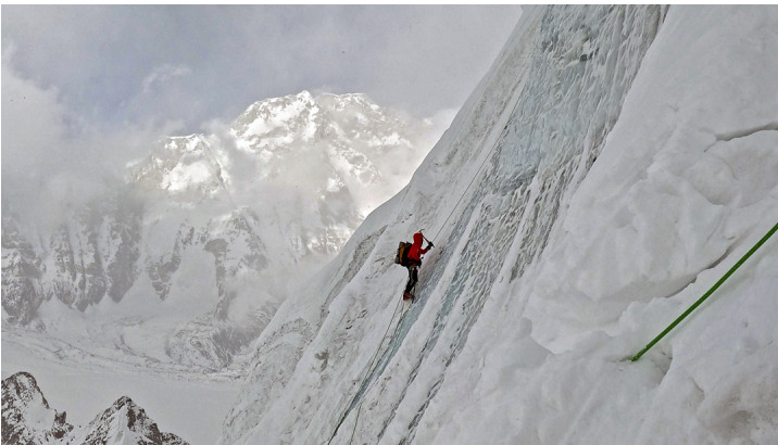
On the lower section of the northwest face of Goldum with Xixabangma behind.