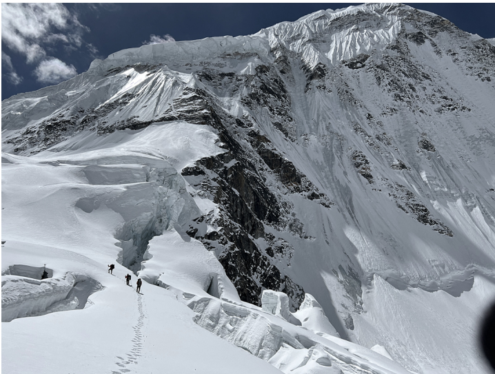
Three of the Korean team moving up toward Camp 2 below the northwest face of Goldum on April 9.