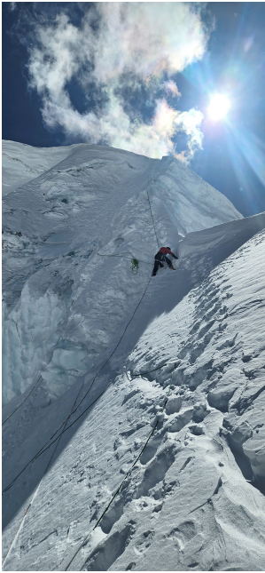
Climbing on the northwest face of Goldum during the first ascent.

The Korean route on the northwest face and north-northeast ridge of Goldum, seen from Camp 2 at 5,898m.