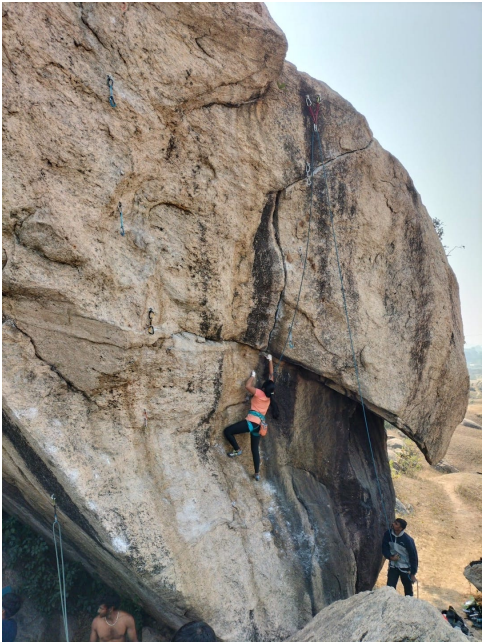
Short climbs at the base of Bansa Hill.