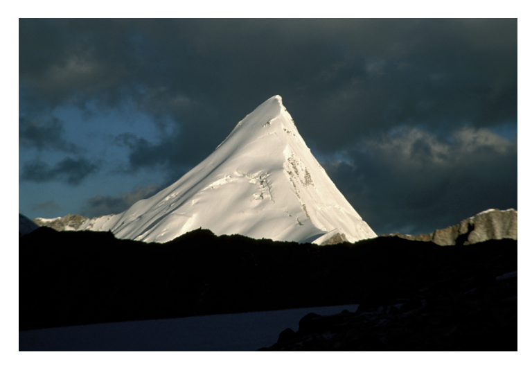
The elegant snow pyramid of Nya Kangri with the east ridge falling toward the camera.