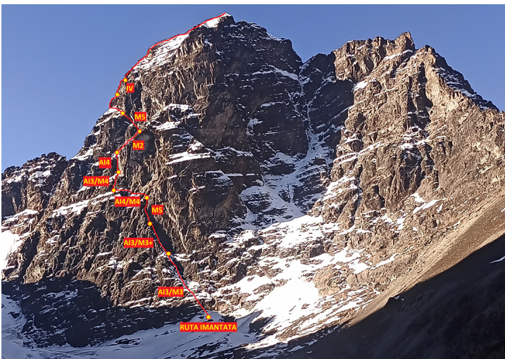
Photo-topo for Imantata (2023) on the southwest face of Huallomen.