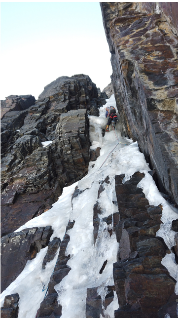
Reynaldo Choque Camardo in the upper part of the ramp leading to the snowfield on Imantata, southwest face of Huallomen.