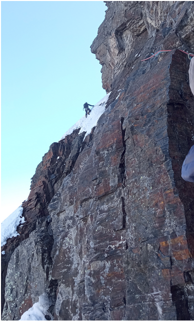
The airy and delicate traverse to the snowfield during the first ascent of Imantata, southwest face of Huallomen.