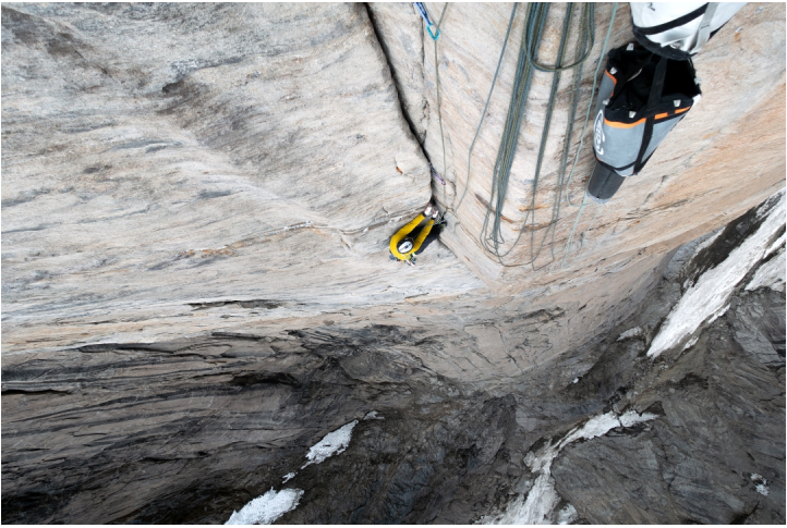
Felix Bub on pitch 13 (6b) of Forum.