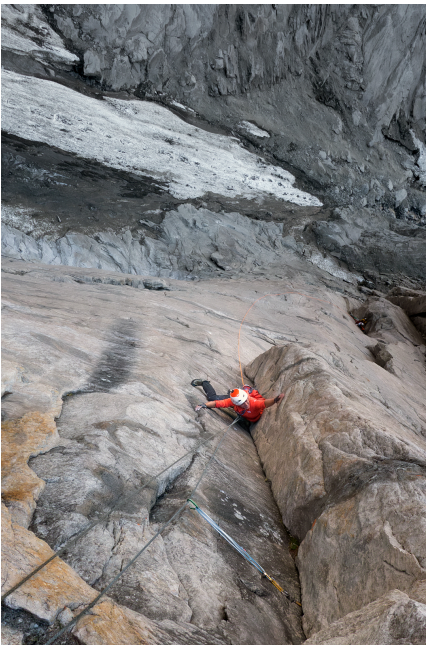
Fay Manners on pitch three (7b) of the new route attempted, and subsequently aborted, on Siren Tower.