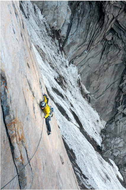
Felix Bub on the ninth pitch (7b) of Forum, avoiding the bolt used for the aided variant.