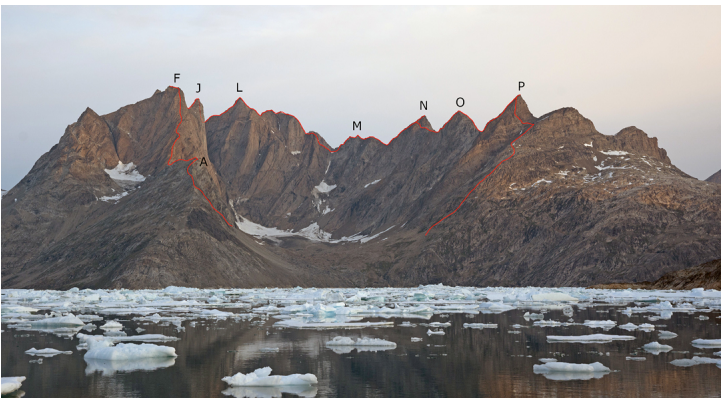
The Mythics Cirque from the east showing the complete Circus Maximus traverse (from left to right). (A) No Tower I East. (F) Ataatap. (J) Siren Tower. (L) Aurora Tower. (M) Prometheus. (N) Tantalus. (O) Sysiphus. (P) Damocles.