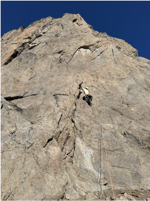
Michelle Dvorak starting up the sixth pitch (6a) of The Princess Brides on Chastity Tower.