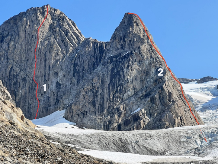
Seen from the north, The Princess Brides (2) climbs the triangular subsummit of Chastity Tower. The main top is to the far left, and the 2021 route (1) climbs directly up its north face.