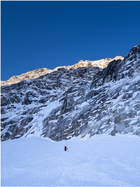
Michael Telstad setting the boot pack up the snow cone to the base of the first pitch on the northeast side of the North Buttress of Augustin Peak.