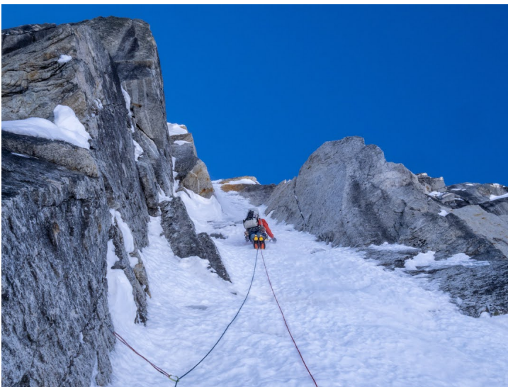
Kurt Ross tiptoes up thin névé through the crux rock band of Augustin Peak's North Buttress (4,600', Alaska Grade 5, AI4).