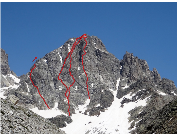
The four known routes ascending Gulba (3,725m) from the south and southwest: (1) West-to-east traverse (2023); (2) Ivasuxari Roza (2014); (3) Khachapuri (2021); and Amaia eta Iker (2023). Remarkably, all four routes were established by climbers from the Basque Country or Spain during