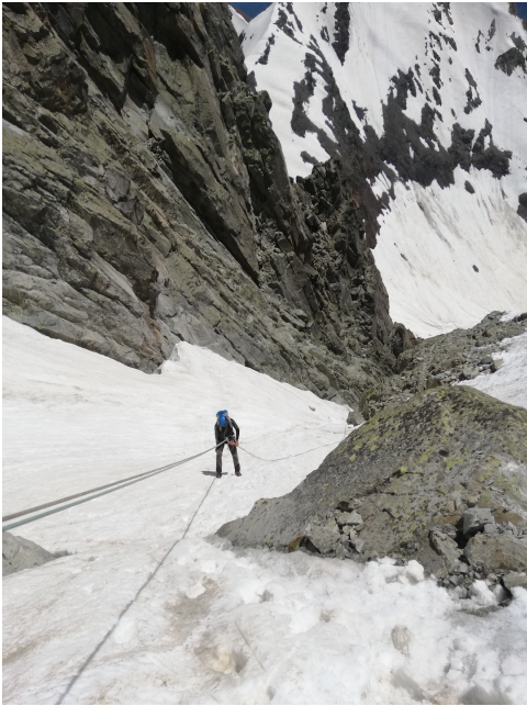
Rappelling down to the glacier after descending the south ridge of Gulba.