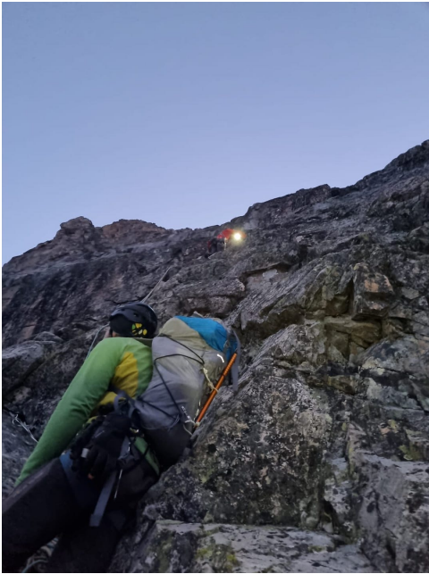
Approaching the first difficult pitch on Amaia eta Iker, a dihedral system that went at 7a+.