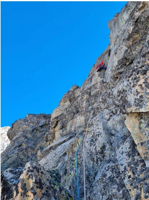
On the crux pitch (7b), a short but sustained dihedral, of Amaia eta Iker on Gulba.