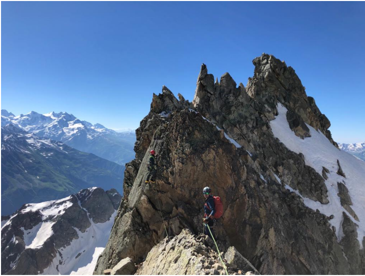
During the west-to-east traverse of Gulba completed in 2023, with difficulties up to 6a.