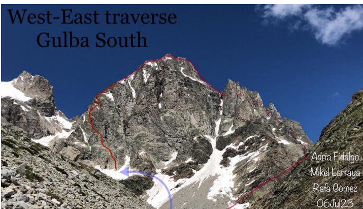
A west-to-east traverse (6a) on Gulba (3,725m) in the Georgian Caucasus, completed in 2023.