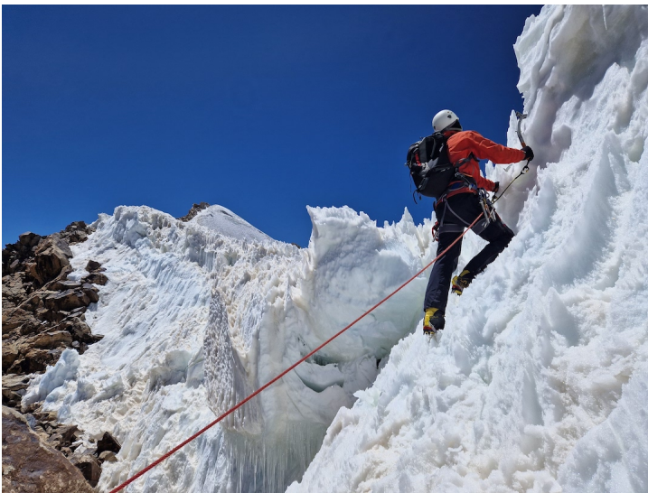
Climbing on Pik Rostovdara in the Shugnan Range.