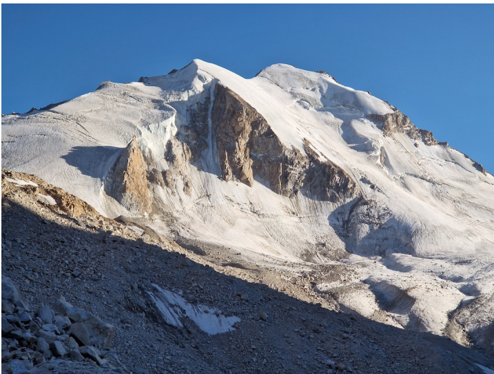
Pik Rostovdara from the north. The 2022 team climbed the ridge to the left to the east summit.