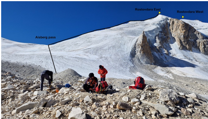
View of Pik Rostovdara and the 2002 route to the east summit (5,310m) by the east ridge.