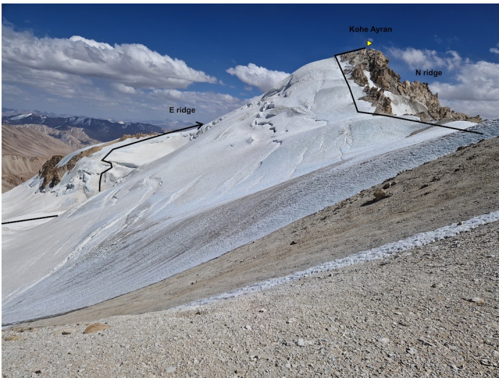
Koh e Ayran from the north, showing the routes climbed in 2022 to the summit.