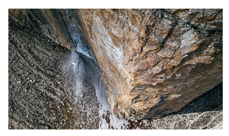
On the last main pitch of Between Two Parties, Kirti Nose.