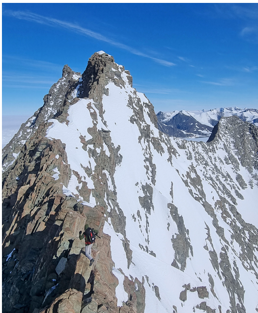
Alex Honnold climbing the east ridge of Mt. Dolence. Beyond the summit, the continuation ridge is visible to the right.