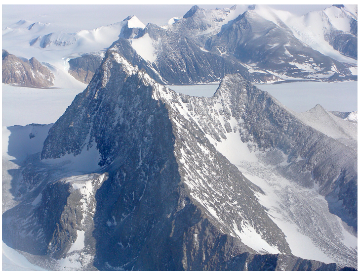
The Dolence "horseshoe." The east ridge of Mt. Dolence falls toward the camera. From the summit, Alex Honnold and Esteban Mena descended the ridge to the right, over the prominent lower northwest top, then down the ridge almost parallel to the east ridge.