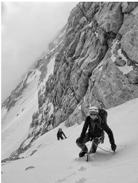
During the 2023 route on the west face of Branscomb Peak.