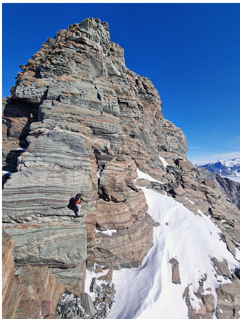
Alex Honnold on the east ridge of Mt. Dolence.