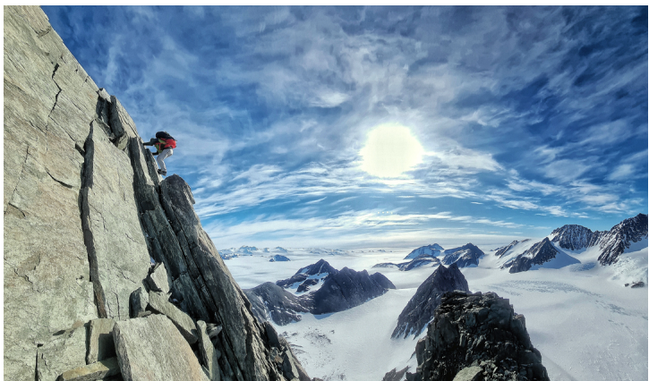
Alex Honnold on Mt. Dolence.