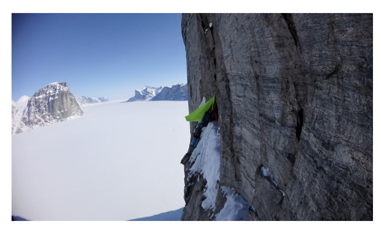
Looking at camp on pitch 13 during the ascent of MikroKozmik Variations (1,062m, VII M5 A4+) on Polar Sun Arm.