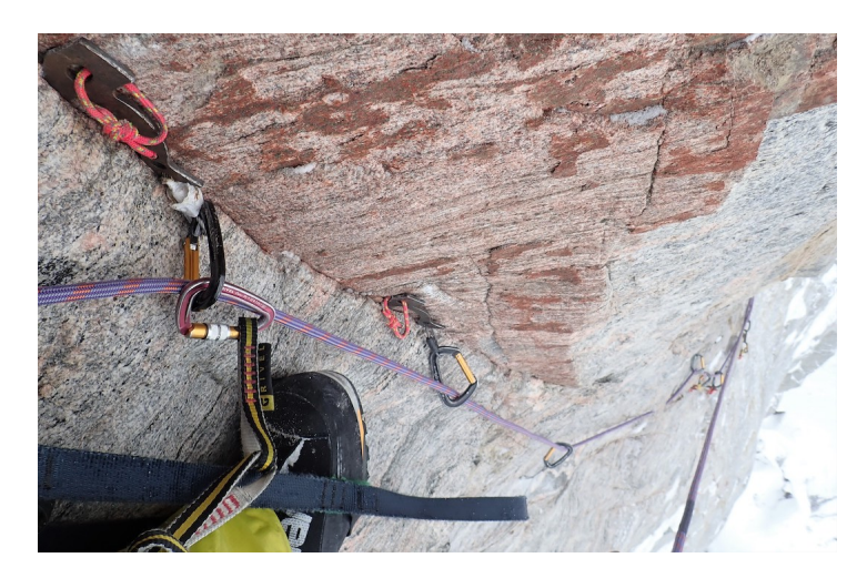
Looking down pitch nine of MikroKozmik Variations (1,062m, VII M5 A4+) on Polar Sun Arm.