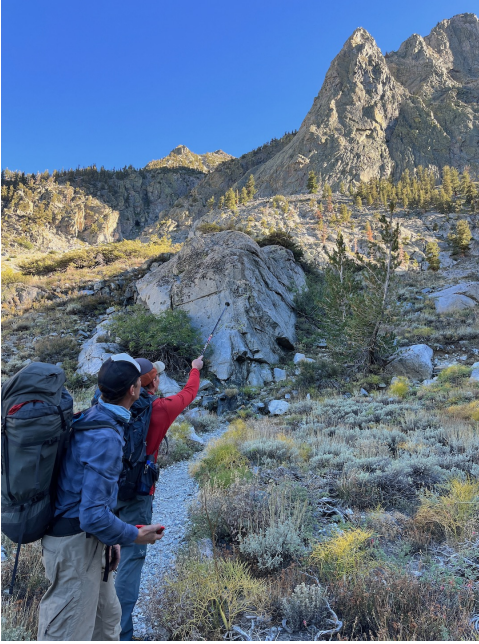
The pyramidal Green Gendarme seen from the Big Pine Creek South Fork Trail. The Northeast Face Direct (9 pitches, 5.10) follows discontinuous features on the shaded left side of the face.