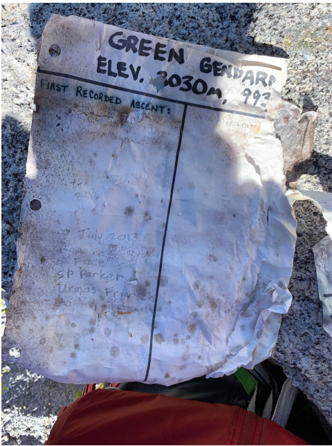
The summit register, as of September 2022, on the Green Gendarme.