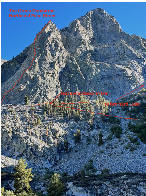
The Northeast Face Direct (9 pitches, 5.10) on the Green Gendarme, Eastern Sierra, California.