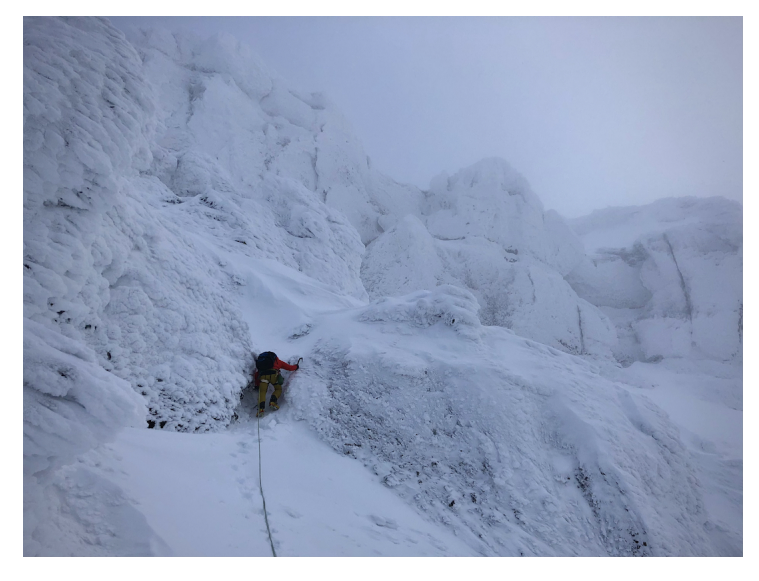
Rusty Willis approaching the final headwall pitches on the north ridge (1,500', M6+ 80° snow) of Abiathar Peak. The January 2023 climb was likely the first winter ascent of the north ridge and possibly the first overall ascent of the feature.