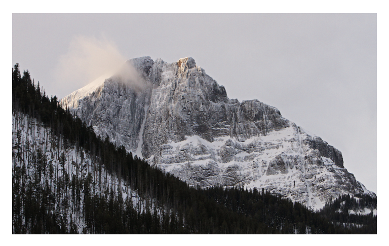
Abiathar Peak in far northeastern Yellowstone National Park. The north ridge is along the right skyline. The Abiathar Couloir is in center left.