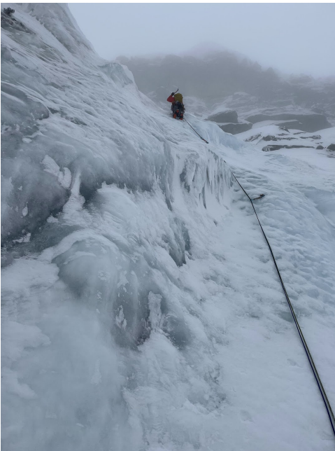
Trey Dufrene leading the WI3 fourth pitch of New Friends (330m, IV WI3 70° snow).