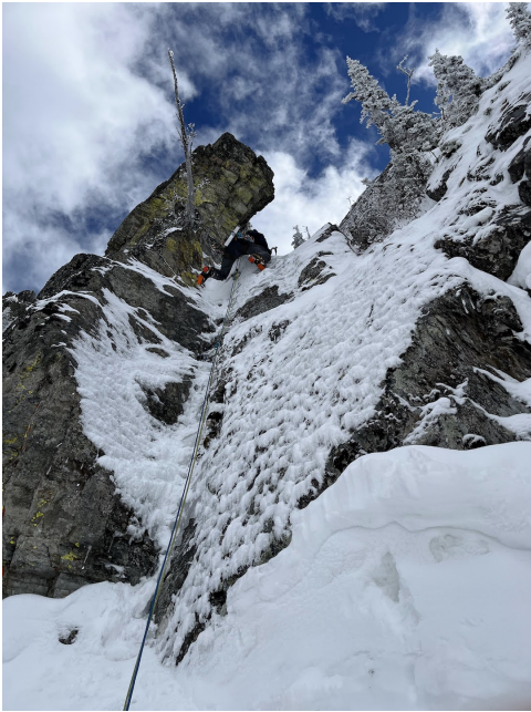
Trey Dufrene surmounting the crux M4 corner of the fifth pitch of Old Friends (350m, IV WI3+ M4 AI3 65° snow) on the northwest face of Rock Peak, Cabinet Mountains, Montana.