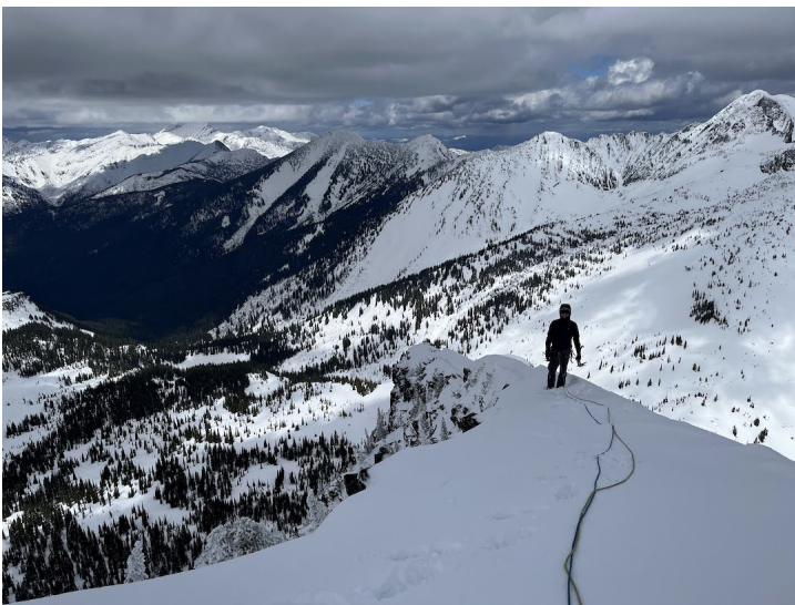
Trey Dufrene topping out Old Friends (350m, IV WI3+ M4 AI3 65° snow) on the northwest face of Rock Peak, with the Cabinet Mountains stretching to the north behind him.