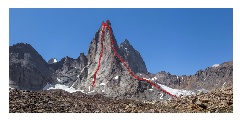
Pik Ostryi from the southeast, showing (1) the 2022 route and (2) the 2021 first ascent route. The summit is near the triangle. Pik Alexander Blok is behind on the right.