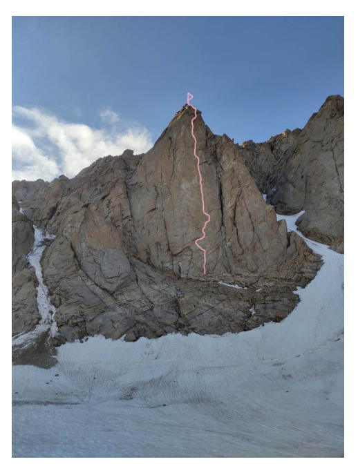
The granite pyramid (elevation 5,057m) climbed in 2022 on the south side of Pik Alexander Blok.