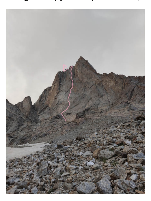
Pyramidal wall at the head of the Dukenek Valley climbed in 2022.