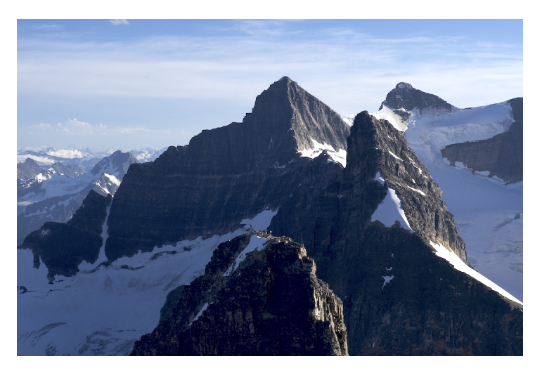
View along the Ramparts, over Paragon Peak and Parapet Peak, to Bennington Peak. The north ridge of Bennington (facing camera) was climbed in 2022.