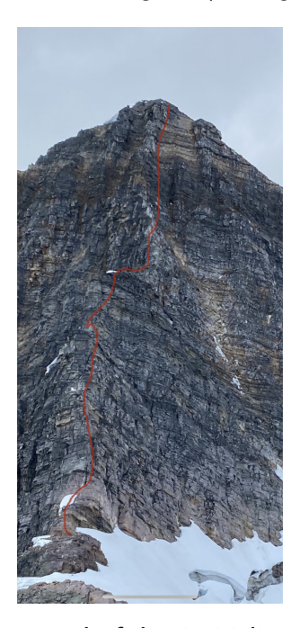
Detail of the 2022 line up the north ridge of Bennington Peak. The north face (left) had been climbed earlier.