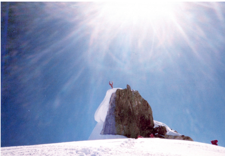
Katsushige Kotera dancing in the sun near the top of Dansam West.