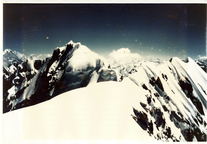
The view from Dansam West to the unclimbed main summit of Dansam.