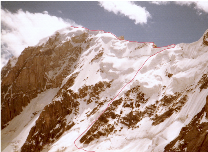
The 1981 route up the north face and west ridge of Dansam West.