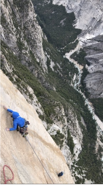
Matt Carpenter leading one of the final slab pitches of One for the Ladies on Tehipite Dome.