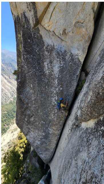
Ryan Evans cleaning pitch 12 of One for the Ladies on Tehipite Dome.