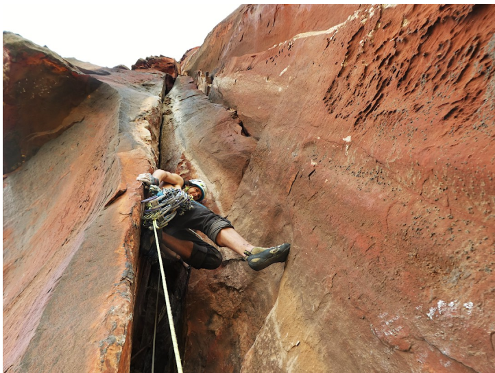
Climbing on Operación Zancudo, Torre de Chochís.