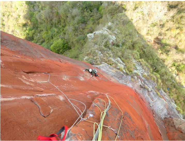
Difficult climbing on Operación Zancudo, Torre de Chochís.