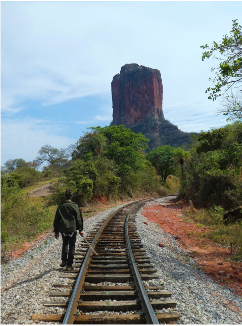
Torre de Chochís (aka La Muela del Diablo).