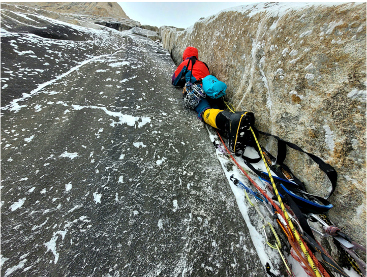
On the first ascent of Frozen Fight Club, Uli Biaho Gallery.