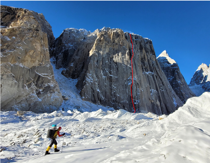
Uli Biaho Gallery seen from the Trango Glacier. For the line of the 2014 Ecuadorian route, see AAJ 2015. Four other routes have been climbed close to the left arête of this wall.