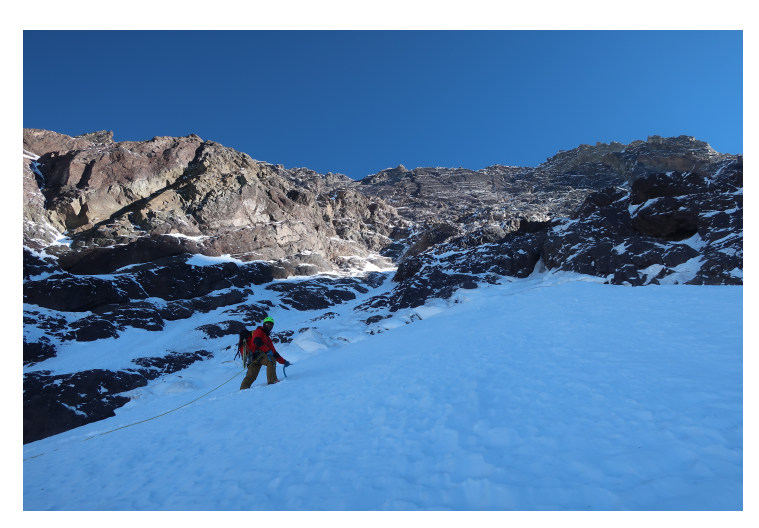
En route on the southeast face of Cerro San Francisco.

The southeast face of Cerro San Francisco indicating the new 2021 variation.