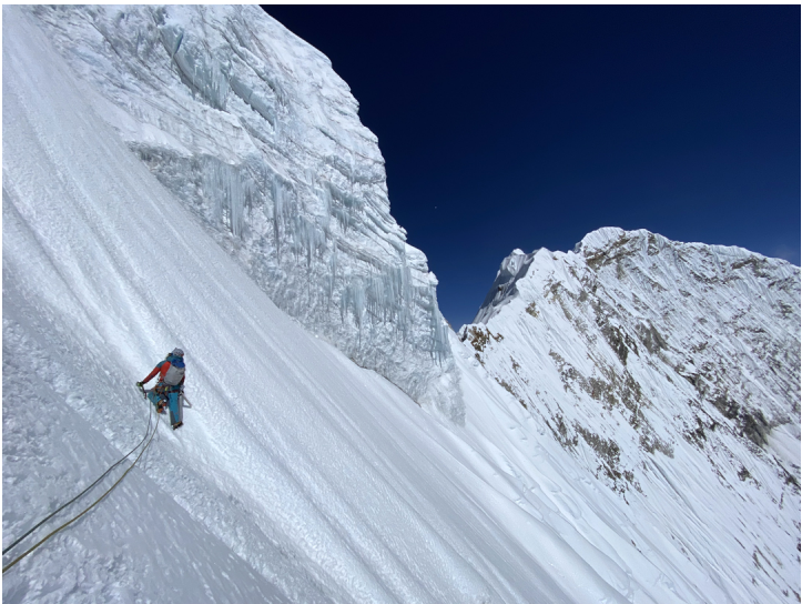
Approaching the crest of the east ridge of Chekigo, with the west ridge of Kang Nachugo (6,737m) to the right.