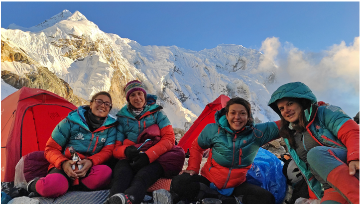
Members of the Spanish female mountaineering team near Tashi Lapcha Pass.