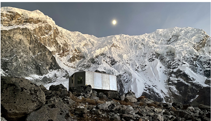
On the Rolwaling side of the Tashi Lapcha Pass stands the recently erected David Lama bivouac shelter, seen here with the chaotic northwest flank of Likhu Chuli Shar (6,719m, summit up to right).