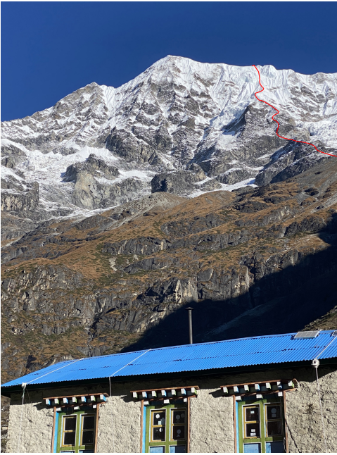
Chekigo seen from Na, with the new Spanish route. For routes to the left on this face, see AAJ 2015.