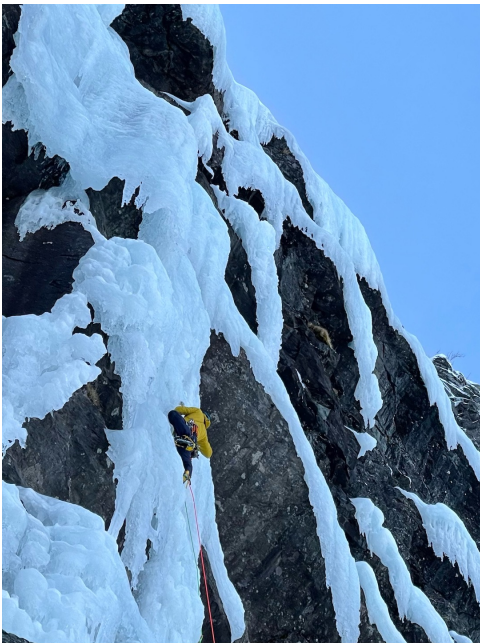
Steep ice on Nattsud (7 pitches, WI6 M4), one of several new routes on the northeast face of Nieras.