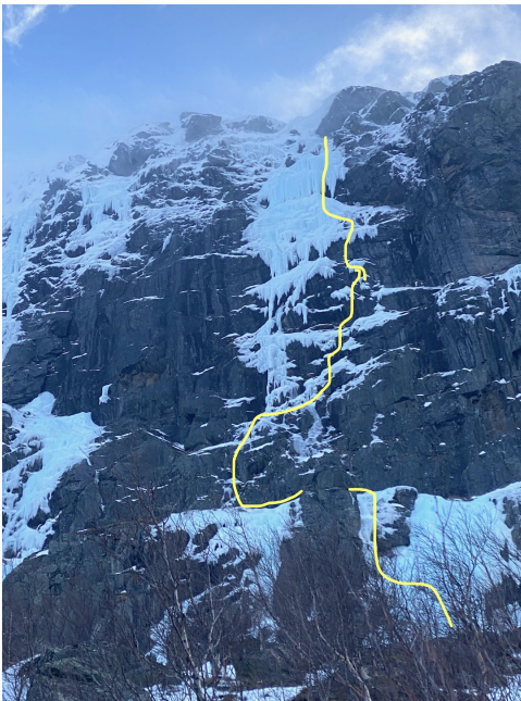
The line of Nattsudd (7 pitches, WI6 M4).