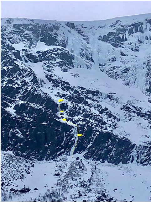
The line of Ninjo on Nieras.