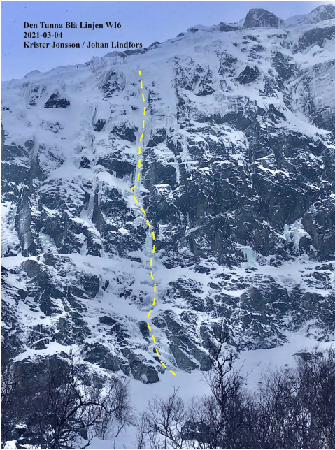
The line of Den Tunna Blå Linjen.