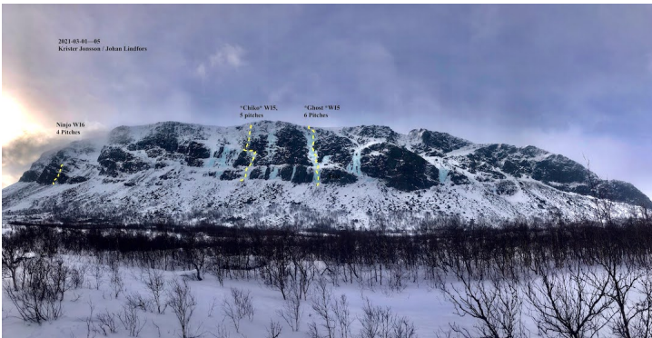
New routes on the northeast side of Nieras.