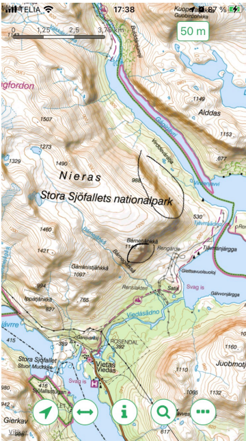
Map of Nieras, showing the location of the southeast and northeast faces.