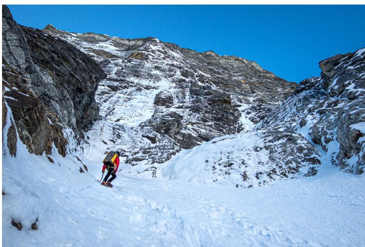
Heading up the lower section of the northwest face of Cholatse. The route continues directly above the climber.