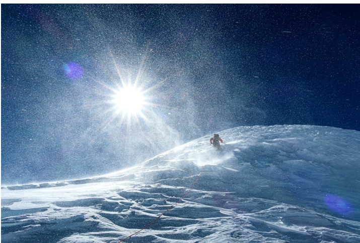
Luka Stražar battles strong wind to reach the summit of Chobutse.