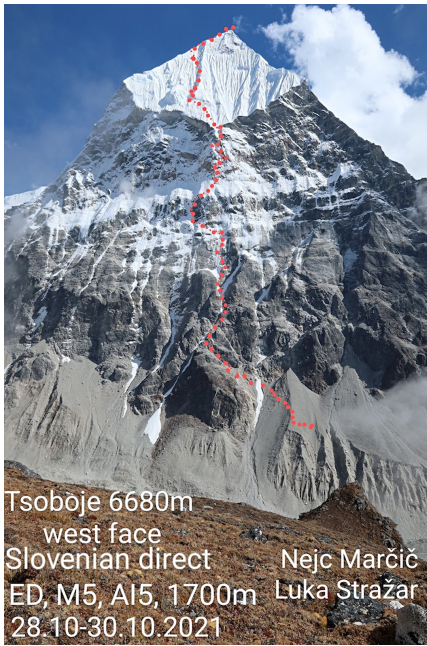
The 1,700-meter route on the northwest face of Chobutse (6,685m).