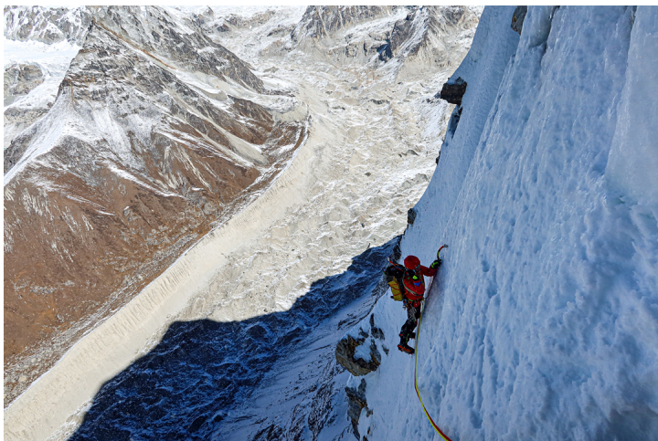
Nejc Marčič on the first pitch of day two on the northwest face of Chobutse. The first bivouac was under the rock visible beneath his feet.