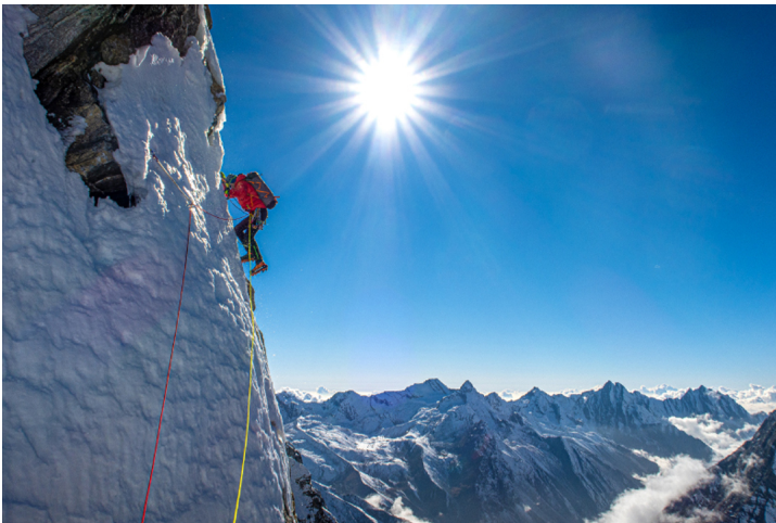
Luka Stražar on an exposed pitch in the middle section of the northwest face of Chobutse.