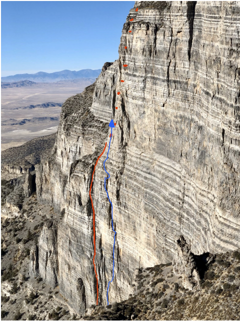
The southwest face of Notch Peak as viewed from the southeast, with the routes Southwest Face Left (red) and Witch Doctor (blue).