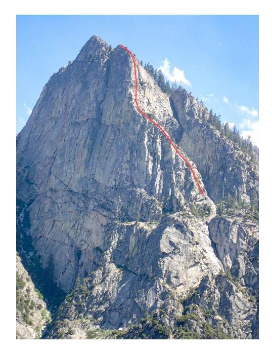
The west arête (ca 1,000', 5.10) on Grand Sentinel.