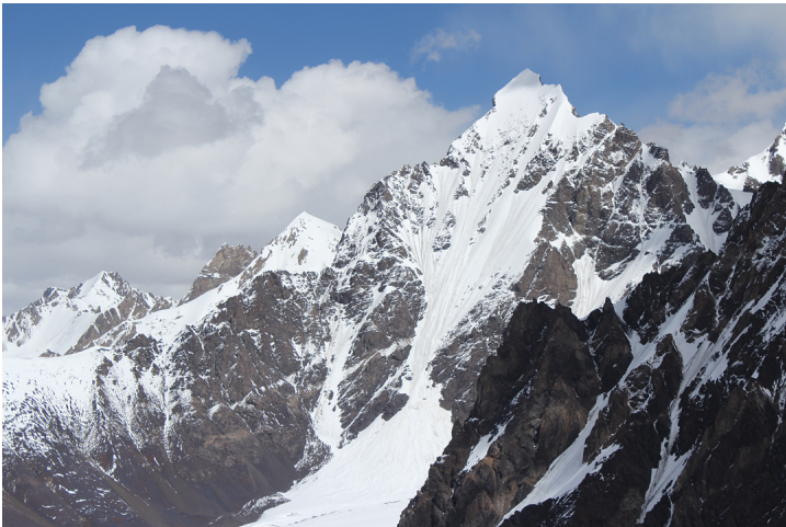
Oblique view of the southwest face of Yawash Sar II in August 2018. Above the narrows, the face is about 850m high.