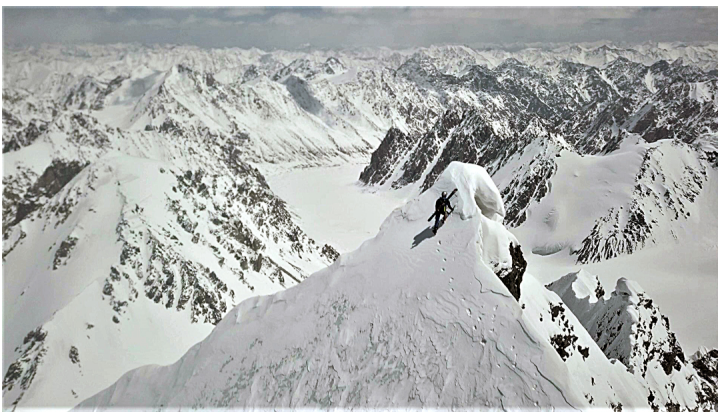
Andrzej Bargiel on the summit of Yawash Sar II, about to embark on a ski descent of the southwest face.