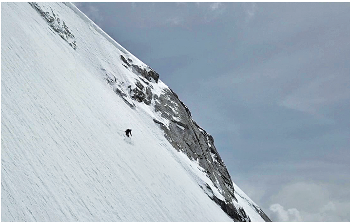
Andrzej Bargiel skiing near the top of the southwest face of Yawash Sar II.