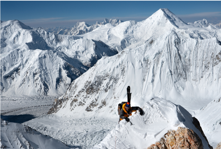
Climbing the French Spur of Gasherbrum II. Across the glacier is the northeast face of Gasherbrum VI and behind it the trapezoidal summit of Chogolisa.