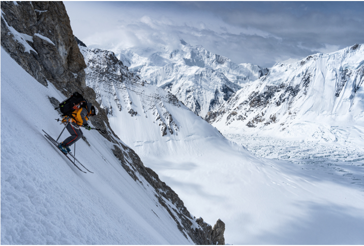
Skiing the French Spur on Gasherbrum II with Baltoro Kangri in the distance.