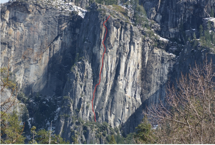
The Fifi Buttress in Yosemite National Park showing the line of the Nexus, a.k.a. The Niels Tietze Memorial Route (900', 10 pitches, 5.13-).