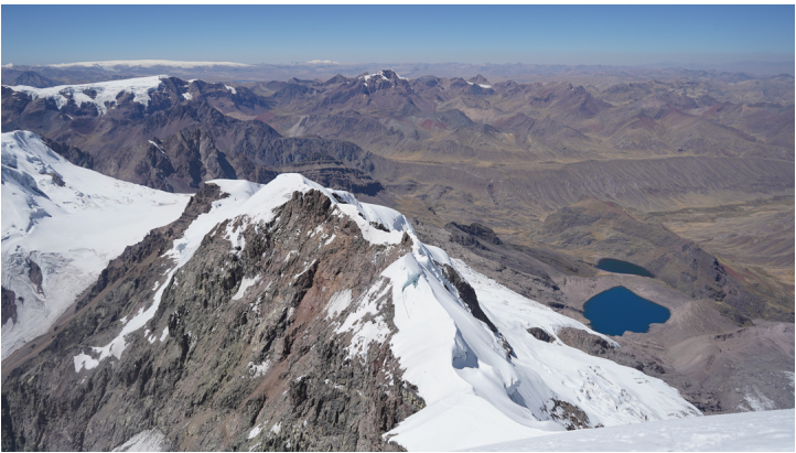
Looking down the southeast ridge (700m, D) of Nevado Mariposa (5,842m).