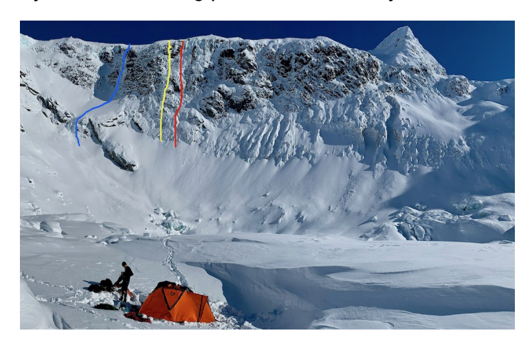
The Suicide Wall heavily rimed after six weeks of precipitation, showing routes completed between 2012 and March 2020: Path of the Fallen (330m, WI5, 2018) in blue, Infinite Jester (350m, WI6 M6+, 2020) in yellow, and Bathtime with Toaster (400m, WI5, 2012) in red.