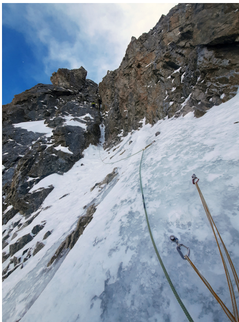
The start of the crux area of Aquadiskotheque, a new route on Pik Simagina, the first of three difficult mixed pitches leading to the east ridge.