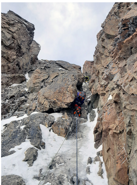
The last pitch in the chimney system on Aquadiskotheque, a new route on Pik Simagina, before reaching the east ridge.