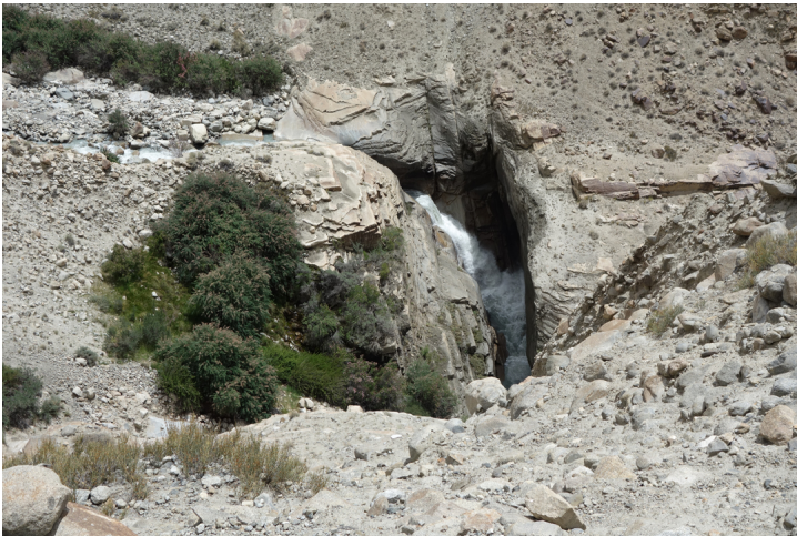
Descending steep scree to the valley floor, where the entire Satti River is channelled into this narrow chasm.