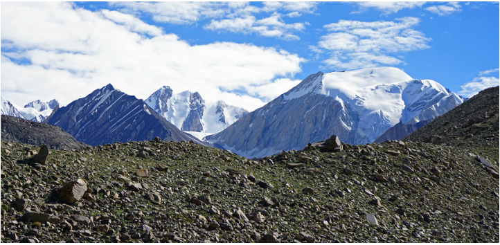
Karpo Kangri (6,540m, center) and Buk Buk (6,289m, snow dome on right) seen from the southwest on the approach up the Satti Valley. In 2005, an Indo-American team reached the 6,525m central summit of Karpo Kangri and climbed Buk Buk.