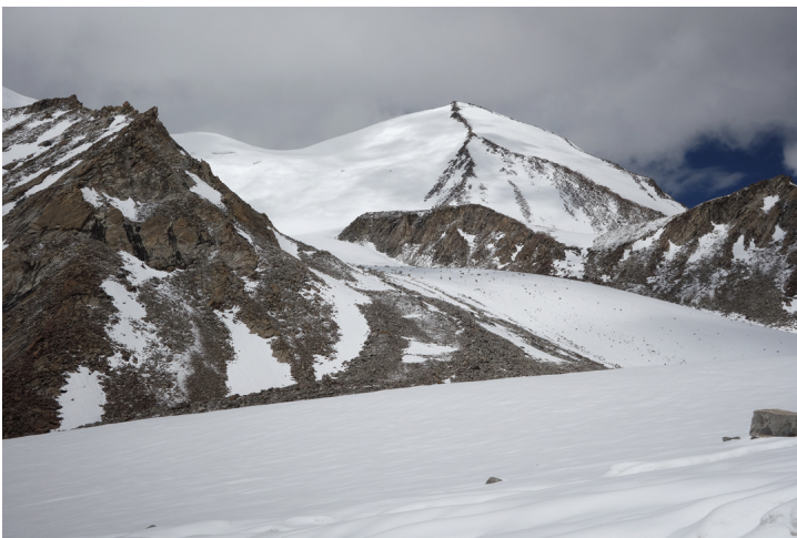
Unclimbed Peak 6,277m seen from the southwest. The side glacier flows south from the mountain into the main Lung Tung.