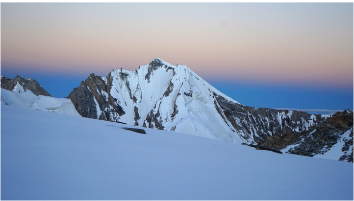
Unclimbed Peak 6,170m immediately south of advanced base and on the southern rim of the Lung Tung Glacier.