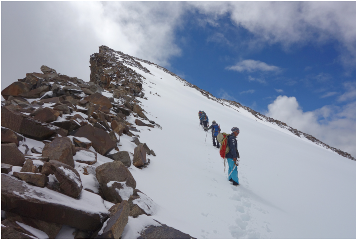
On the upper northwest ridge of Tashispa Ri.