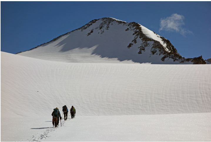
Setting out for Tashispa Ri, which was climbed by the left skyline (northwest ridge).