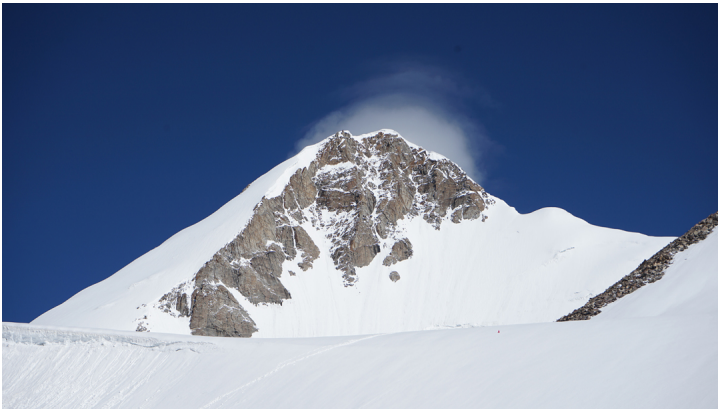
Unclimbed Peak 6,489m on the northern rim of the Lung Tung Glacier. It is the highest peak accessible from this glacier basin.