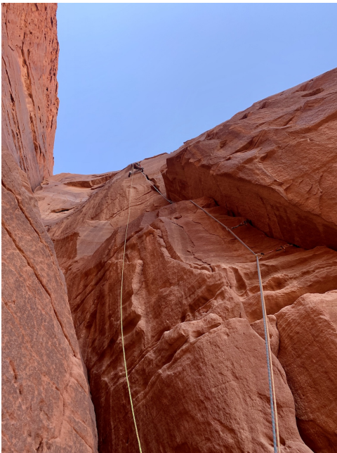
Climbing on Au Grès du Vent on Jebel Khazali.