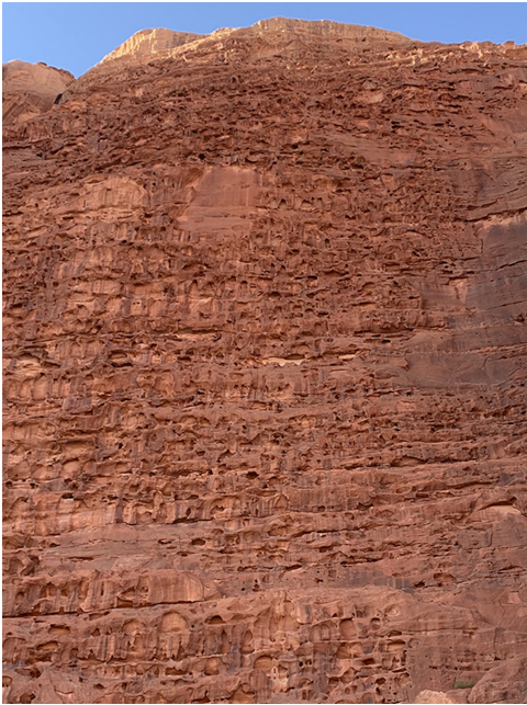
The sea of holes followed by the Zalabia Route, Jebel Khazali.