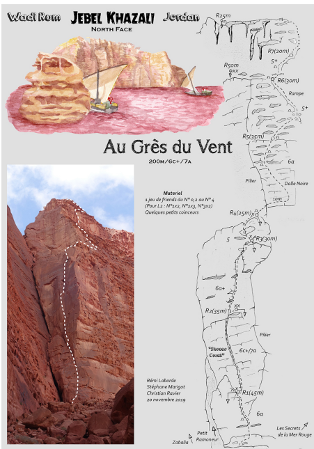
Top of Au Grès du Vent on Jebel Khazali.