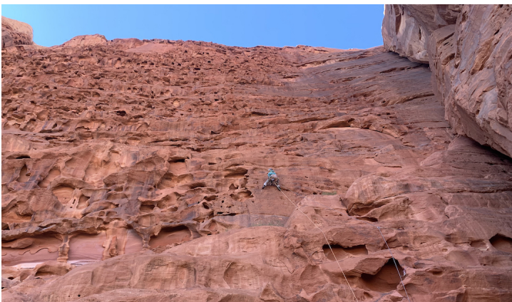
Topo of the Zalabia Route, Jebel Khazali.