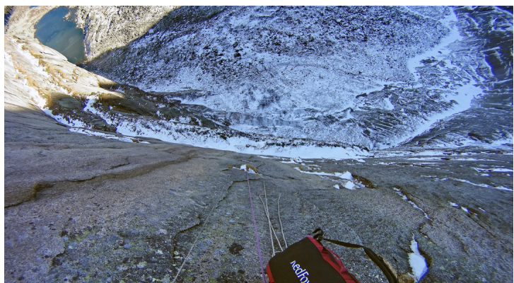
Looking down the northeast face of Zvezdny during the first ascent of the Ivanov-Zhigalov route in October 2019.