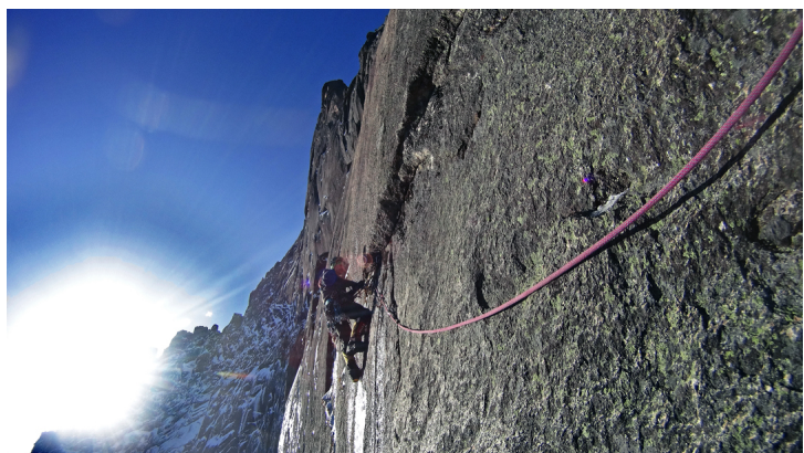
On the first ascent of the 2019 Ivanov-Zhigalov route on the northeast face of Zvezdny.