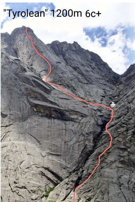
The line of Tyrolean on Silver Wall seen from below.