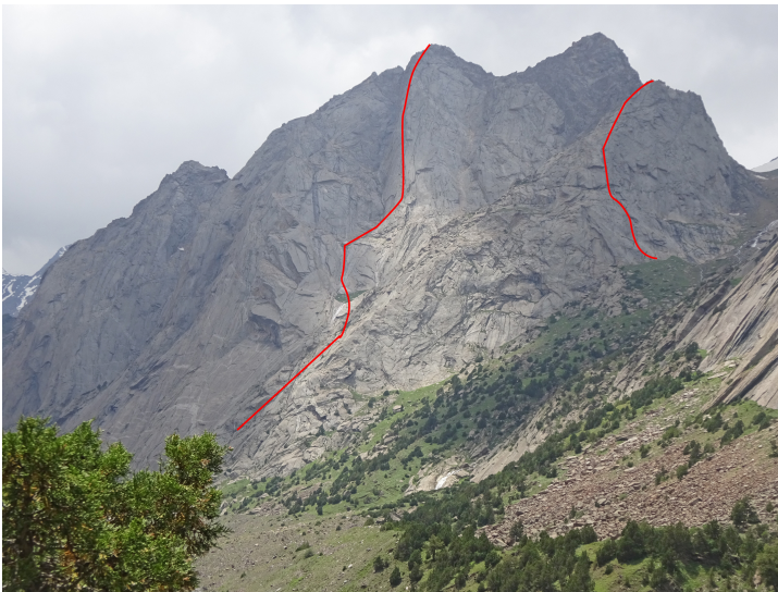
Silver and Green walls in the Kara-su Valley seen from the north-northeast. Approximate lines of the two new 2019 Austrian routes are marked: Tyrolean, to the main summit of Silver Wall, and Eaßtbeugung on Green Wall.