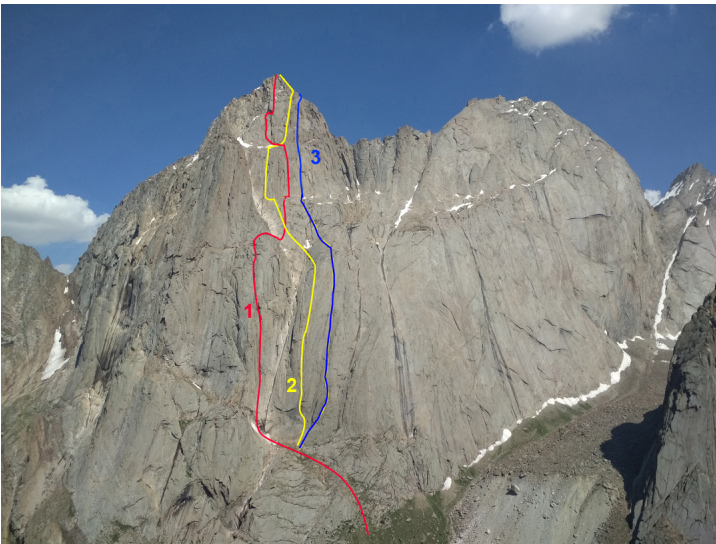
Kotina and Kirkchilta (right) seen from the west, with the 2019 ascents shown. (1) Operation KIK. This route is a direct finish to a route from 2012 that finished to the left. (2) Krukonogi. (3) Krasnoyarsk Route.