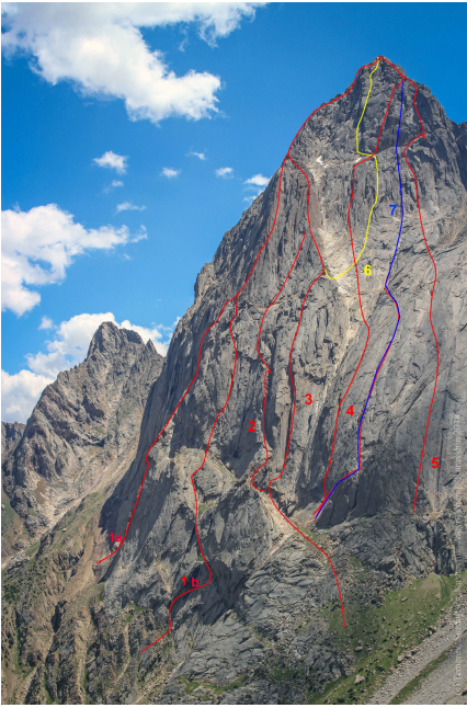
Kotina from the southwest. (1a) Russian Direct on Dreaming Spires (2018, to summit). (1b) Dreaming Spires (2012, not to summit). (2) An Inconvenient Truth (2012). (3) Awesome Fucking Dihedral (2012). (4) Krukonogi (2019). (5) Czarna Wolga (2006). (6/yellow) Operation KIK (2019). (7/blue) Krasnoyarsk Route (2019).