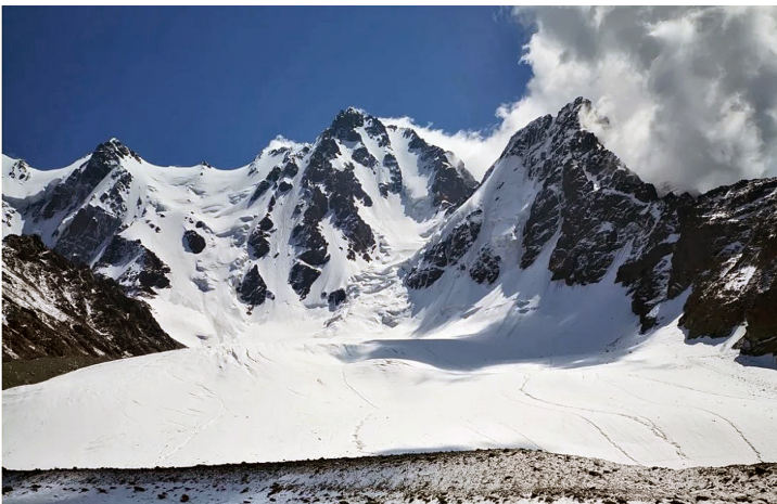
The northwest face of Bogda V and route of 2019 Chinese ascent. Bogda I (5,445m) is off picture to the left.