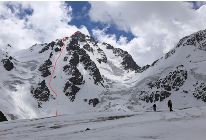
The 2019 Chinese route on the northwest face of Bogda V. The final difficult ridge to the summit is not visible.