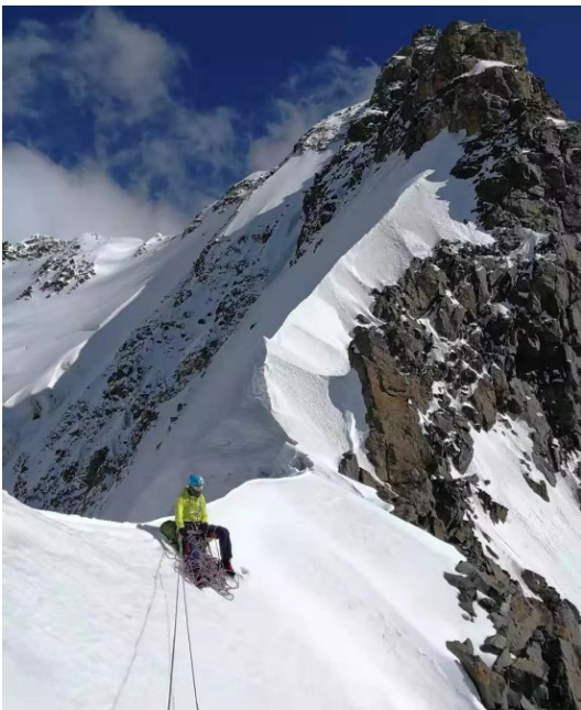
On the final ridge just above Camp 2. The route followed the snow crest and then climbed the steep final rock buttress on the left flank.