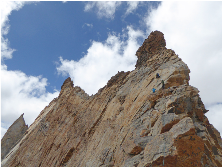
Italian climbers nearing the north summit of Chareze Ri (the higher tower to the left). An attempt to cross the knife-edge connecting ridge to the main summit beyond was foiled by darkness.