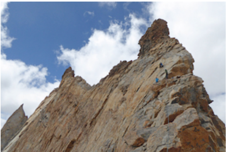
Long Route in Zanskar