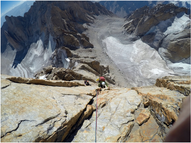
Day two on the east-northeast ridge of Chareze Ri North.