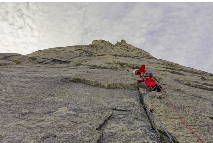
Lionel Daudet climbing on the northeast face of Ataatap Tower.