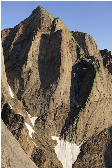
The southeast face of Aurora Tower from Ataatap Tower, showing the line of the 2018 French route.