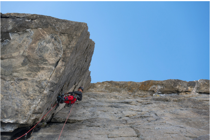
Patrick Wagnon aids an overhanging corner on the northeast face of Ataatap Tower.