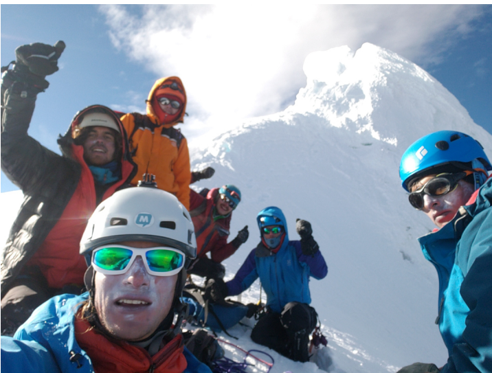
The team poses just below the main summit of Nevado Huantsán.