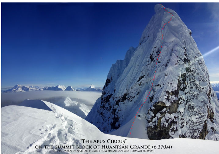
A close view of the 2018 route up to the main summit (6,395m) of Nevado Huantsán, as seen from the west summit. Nathan Heald noted that this photo was taken on a previous attempt in 2017, when there was much more snow than on the successful 2018 climb.