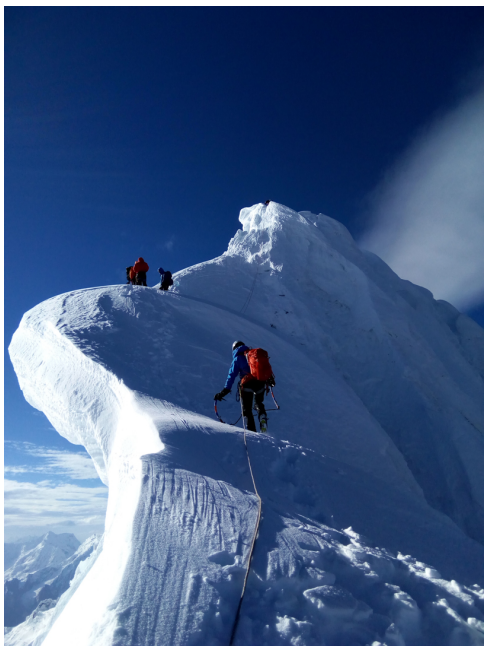
The team approaches the overhanging summit cornices of Nevado Huantsán.