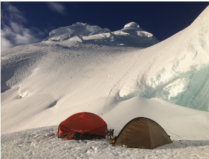
The 2018 team's high camp with the west summit of Nevado Huantsán behind.