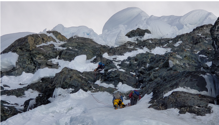
Nathan Heald leading steep mixed terrain below the main summit of Nevado Huantsán.