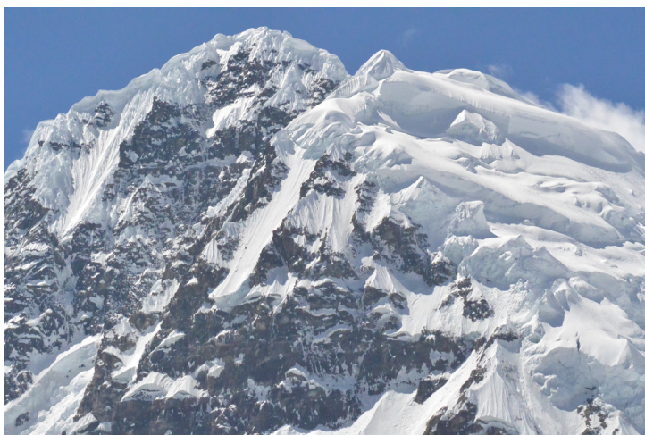
Looking up toward the west summit (6,270m) and main summit (6,395m) of Nevado Huantsán.