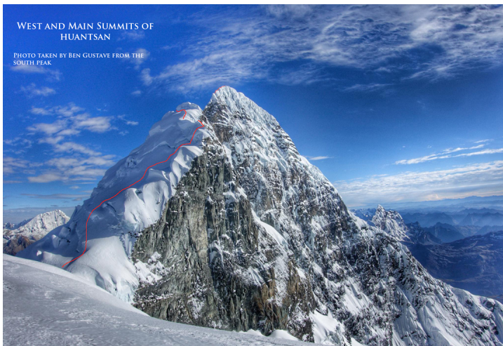
The route on the south ridge of Nevado Huantsán to the west summit (6,270m) and main summit (6,395m), as seen from the south summit.