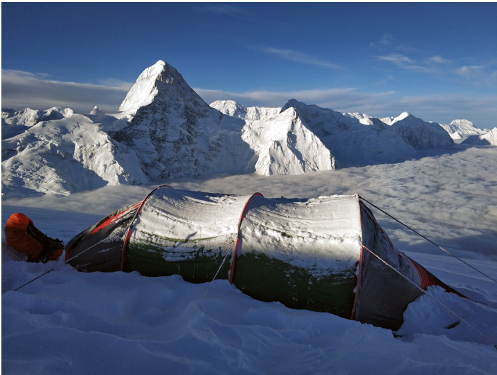
Camp on the summit of Bayancol, with the north face of Khan Tengri (6,995m) prominent behind and the top of Pik Pobeda (7,439m) seen through the high col immediately to the right.