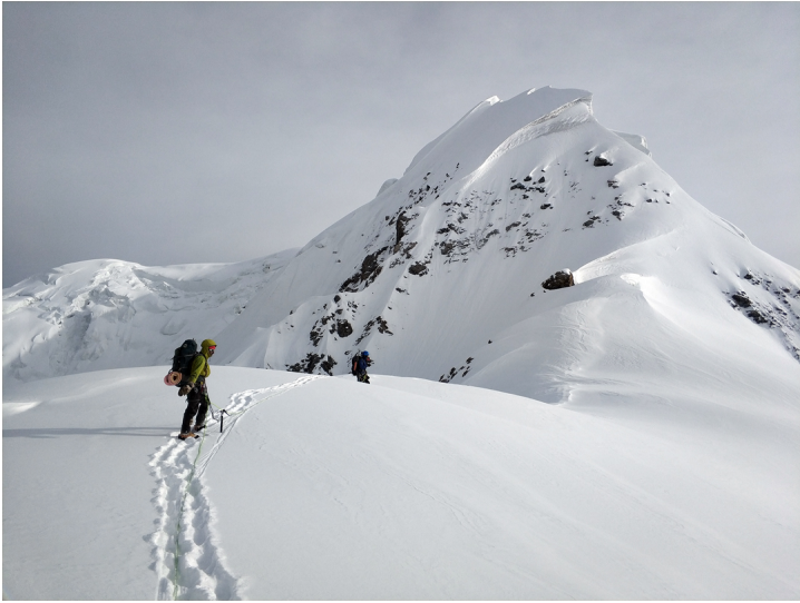
Tursunali Aubakirov following Igor Malkin on the upper section of the southeast ridge of Bayancol, with the top section of the unclimbed southwest ridge forming the left skyline.