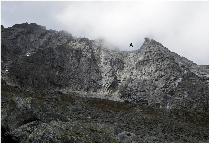
(A) The spectacular rock arch below the north-south ridgeline of the Khela Danda, northwest of Mugu Village. The main summit lies up to the left in cloud. (C) is the couloir attempted in autumn 2018.