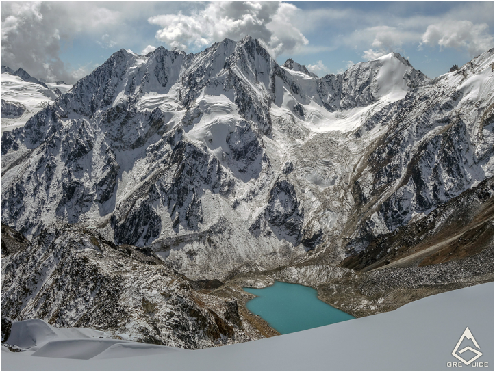
Looking south from the col reached by Les Brasseurs Savoyacks at peaks in the little-known Chhochenphu Himal, rising to around 6,000m.