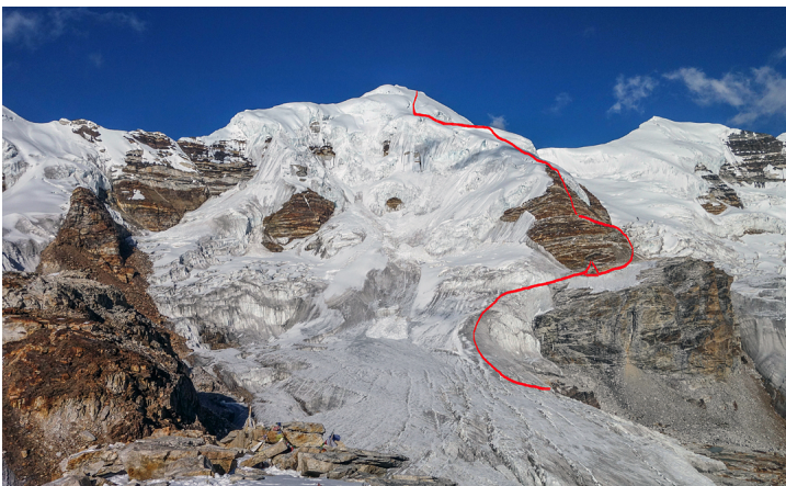
Yanme Kang south face and route of ascent seen from the Ghang La (5,746m) on the Nepal-Tibet frontier.