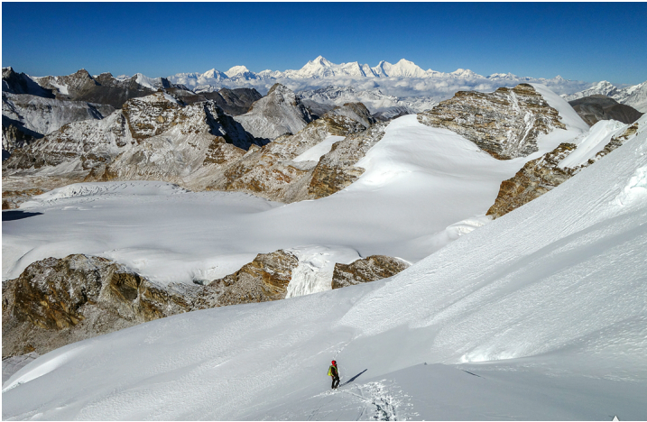
En route to the summit of Yanme Kang via the south face. In the background the Tibetan side of the Makalu–Everest ridge.