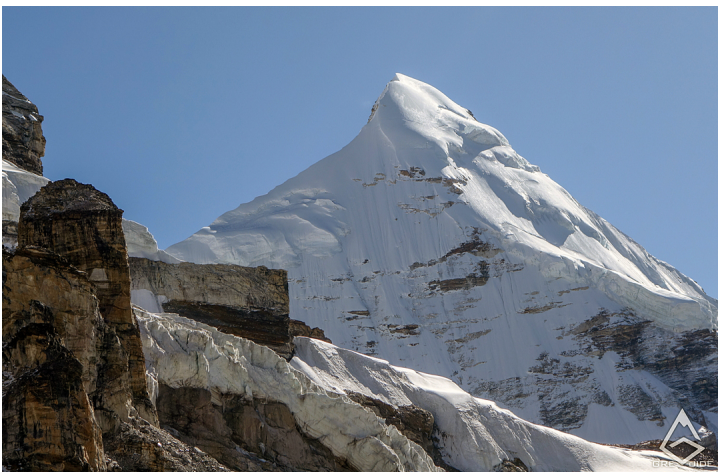
Nangamari from the northwest. This peak was first climbed by Australians in 2010 via the southwest ridge (right skyline).