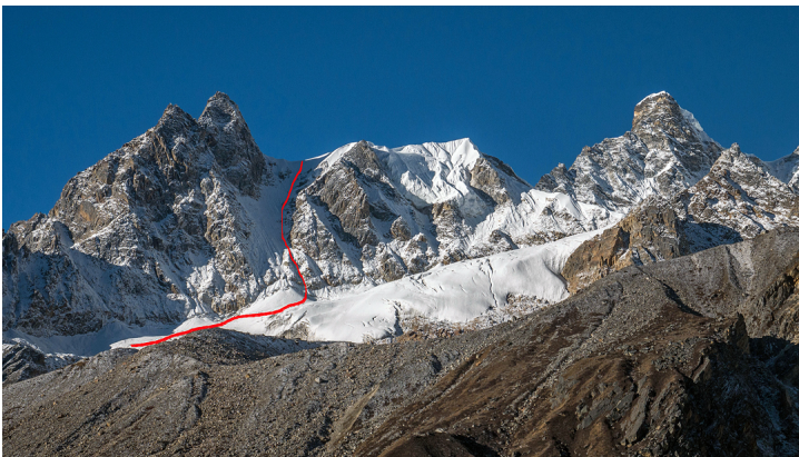
Les Brasseurs Savoyacks to a ca 5,700m col on the east-southeast ridge of Senup.