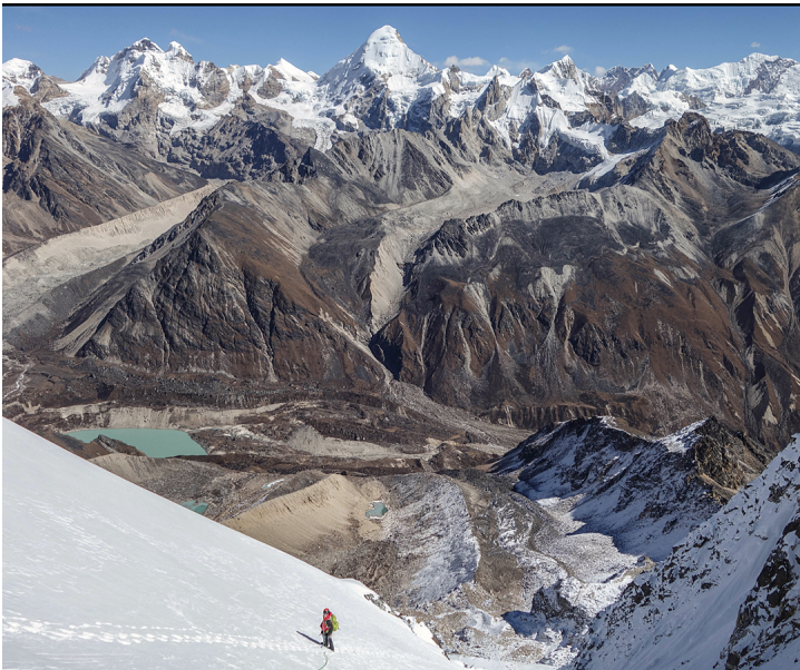
Nearing the top of Les Brasseurs Savoyacks, with a magnificent panorama of largely unclimbed peaks to the northeast. Dominant, more or less in the center, is Nangamari I. The high, triangular-topped peak near the left edge of the image, with an almost rocky summit area, is Lang Chung Kang.